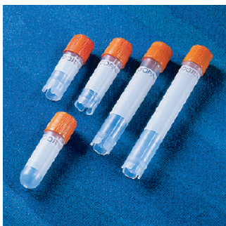
Corning offers a variety of cryogenic vial sizes and cap styles.

Frequently check nitrogen levels in freezers; a schedule should be established and strictly adhered to. Audible alarm systems for detecting low liquid nitrogen levels are available to provide additional safeguards. However, they provide a false sense of security if not monitored 24 hours a day. Valuable or irreplaceable cultures should be stored in at least two separate facilities. ATCC provides a safe deposit service for this purpose; they can be contacted at 703.365.2700 for additional information on this service.